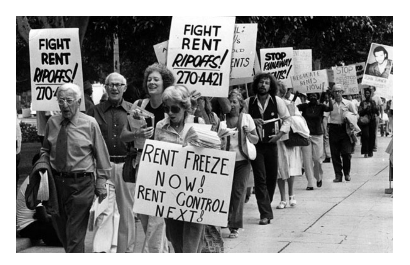
Figure 2. Renters march on Los Angeles City Hall, 1978.

Councilmembers led by Joel Wachs, who represented many of the neighborhoods affected by escalating rents, had already been advocating for some form of rent control for nearly a year. In mid-July 1978, the failure of many landlords to pass on property tax savings to tenants caused Mayor